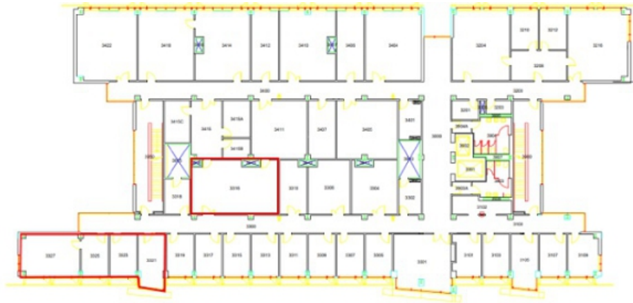
Pittsburgh Technology Center Floor 3

Certain suites located on the 3rd floor the Pittsburgh Technology Center, 700 Technology Drive, Pittsburgh, PA 15213, designated as: Room 3316 comprised of 621 SF, Room 3321 comprised of 187 SF, Room 3323 comprised of 154 SF, Room 3325 comprised of 152 SF, and Room 3327 comprised of 329 SF.