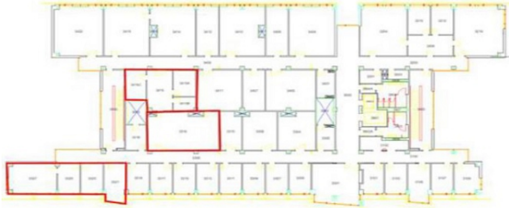
Pittsburgh Technology Center Floor 3

And certain suites located on the 4th floor designated as: Room 4315 comprised of 153 SF.