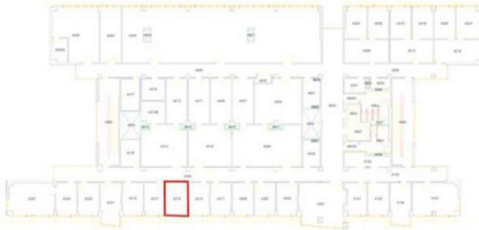
Pittsburgh Technology Center Floor 4